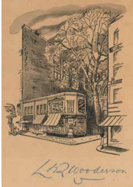
L & R Wooderson menswear shop. Sketched by Vivien Hislop, London Evening News