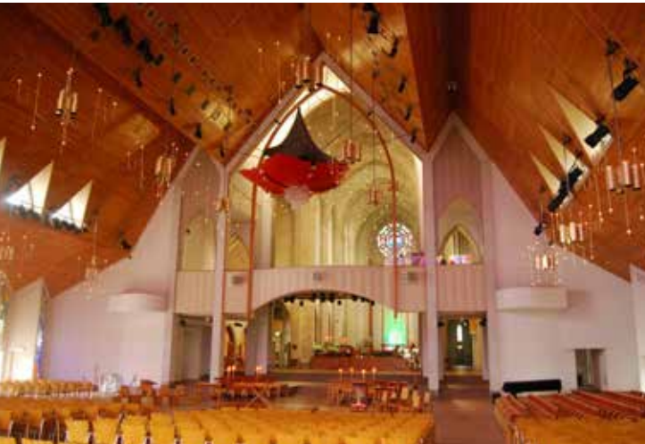
Nave before bridge removed 1996 to 2017