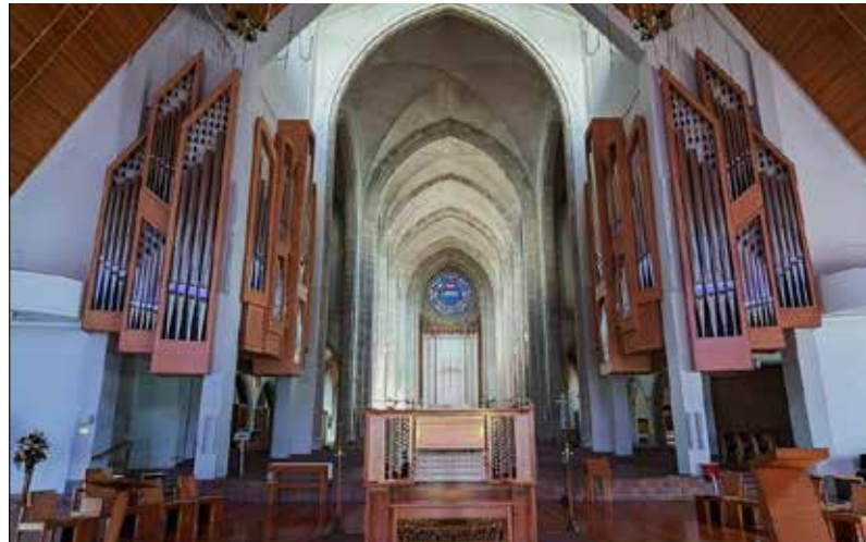
Nave with bridge removed and organ installed 2017