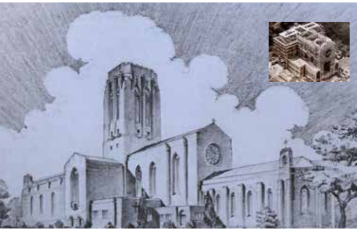
Towle's 1940s design was only partially completed